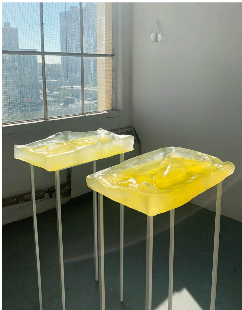
Gyun Hur Composition of us and the river - "liken it to the dance" , Casted glass and river water. Studio view in Sunset Park, Brooklyn, New York, 2021